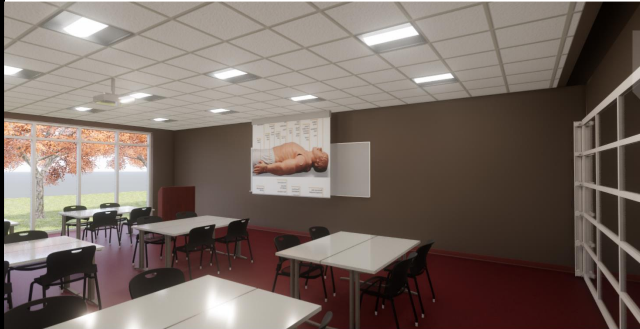
TWENTY-FOUR STUDENT CLASSROOM (1 OF 3)