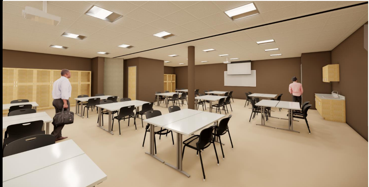
TWENTY-FOUR STUDENT CLASSROOM (1 OF 3)