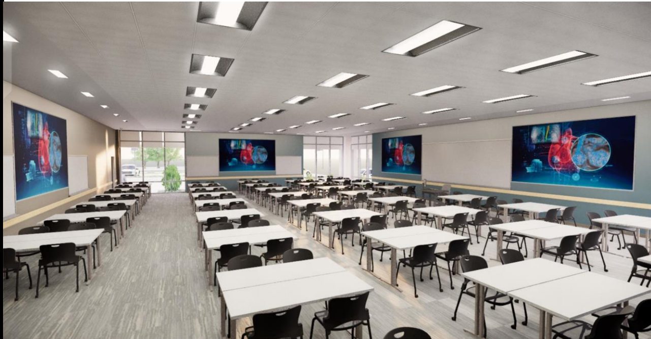
MULTI-PURPOSE | COMMUNITY ROOM