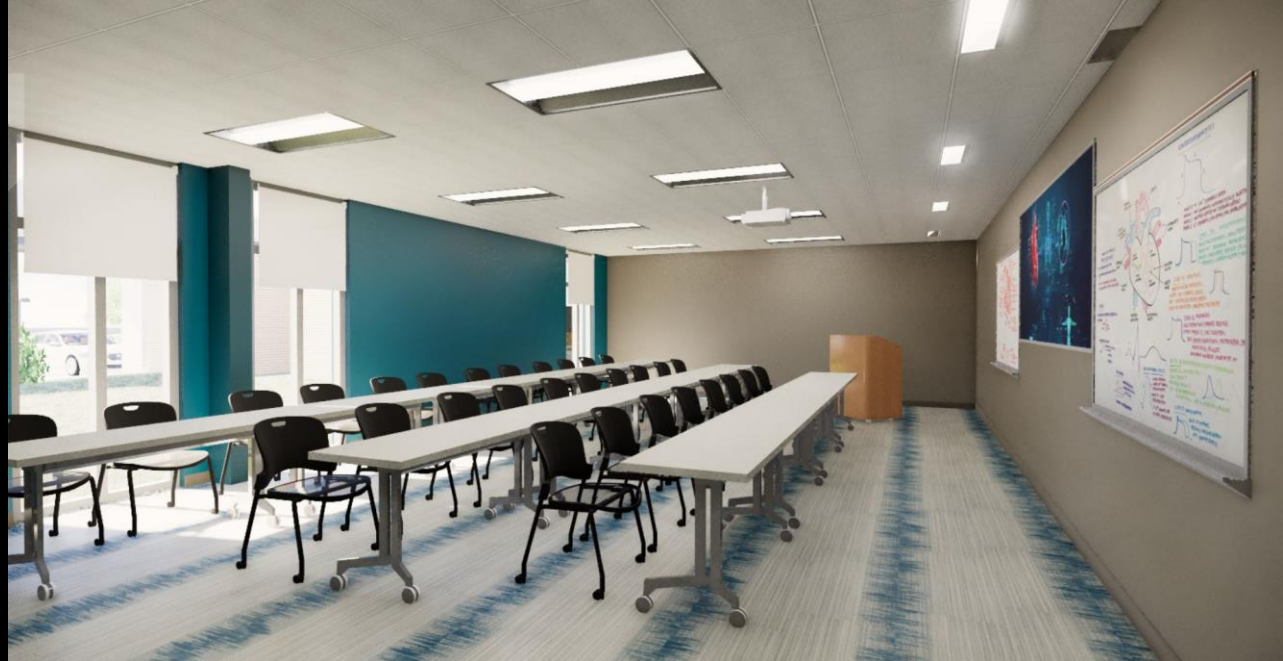
CLASSROOM (1 OF 6)