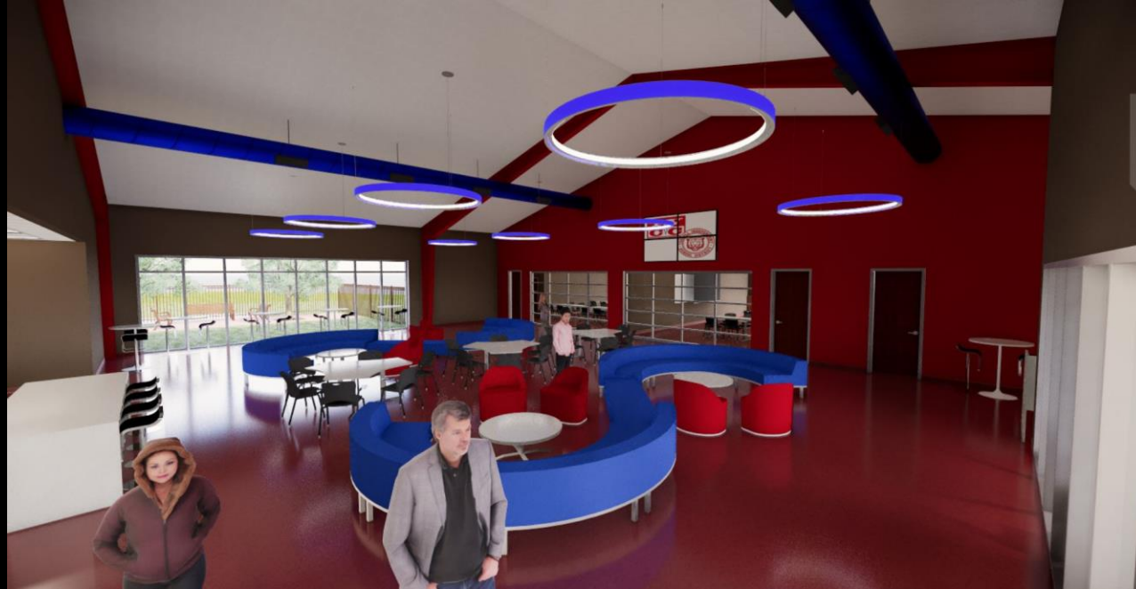
STUDENT LOUNGE | STUDY AREA