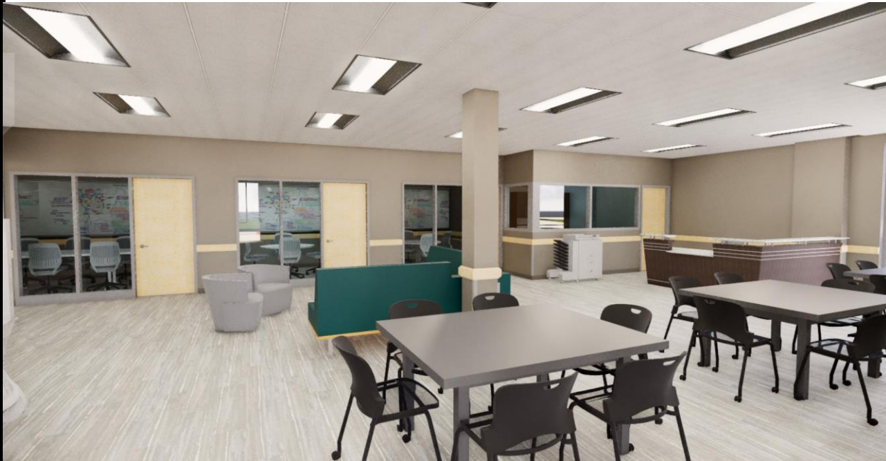
LIBRARY | COLLABORATION