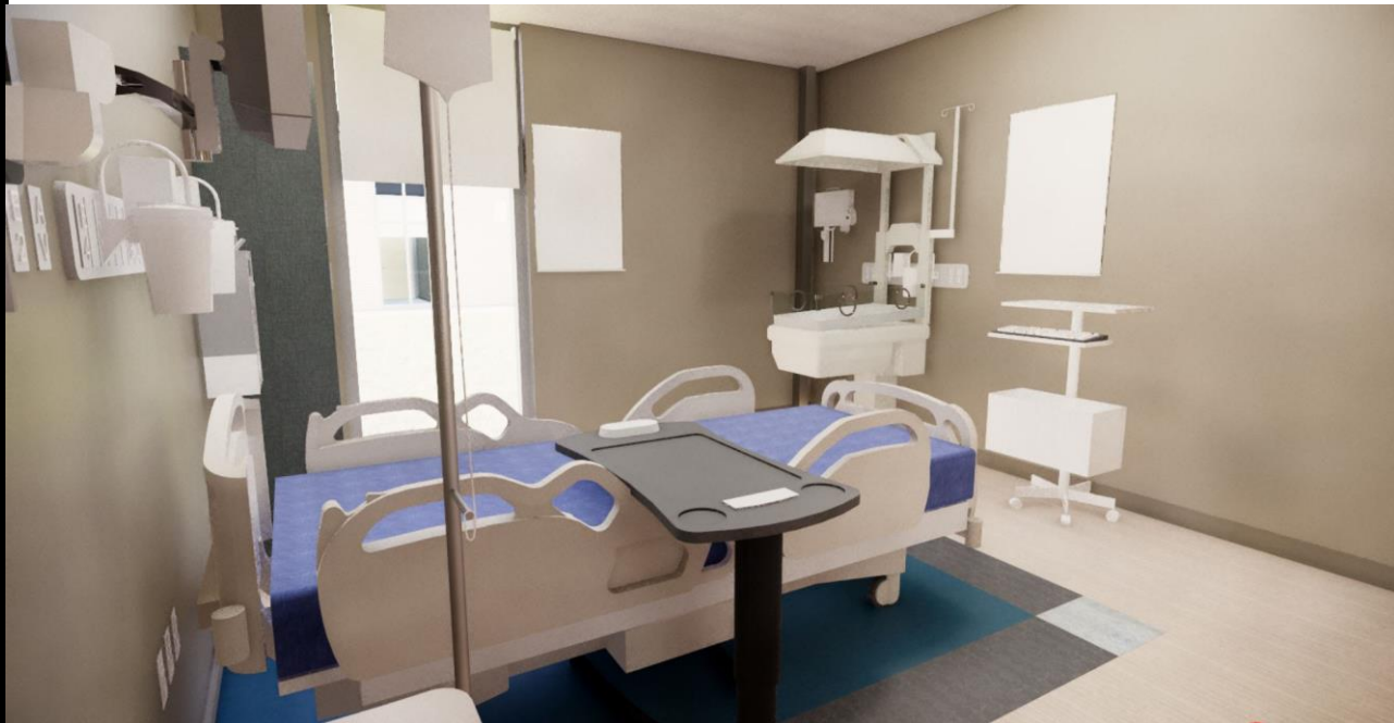
L&D ICU SIMULATION