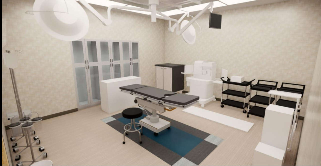
INTER-PROFESSIONAL DEVELOPMENT (IPD) LAB