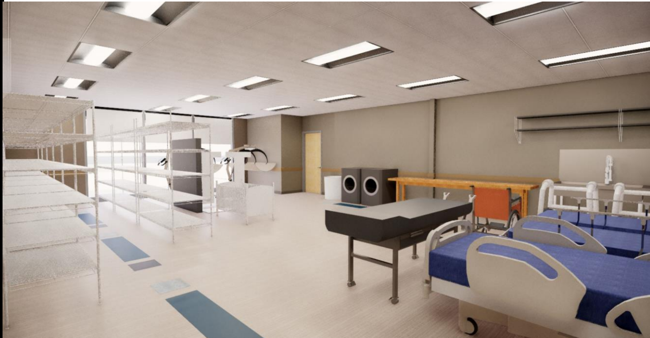
LAB PREP ROOM