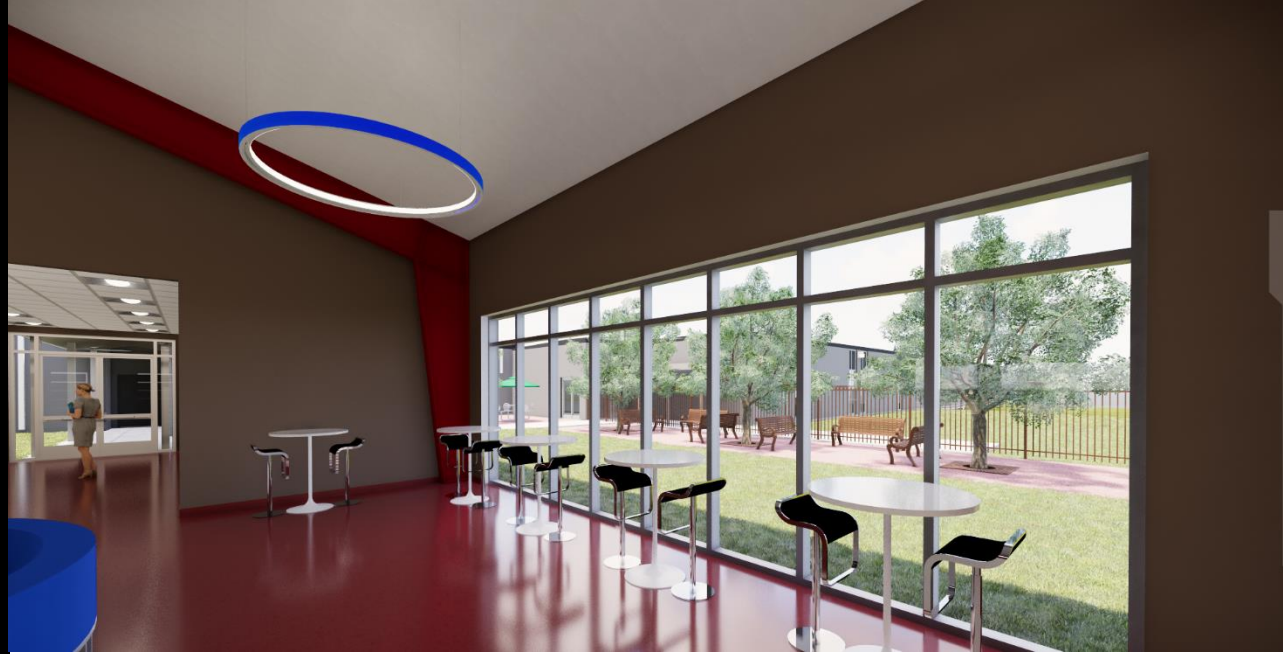
STUDENT LOUNGE | STUDY AREA