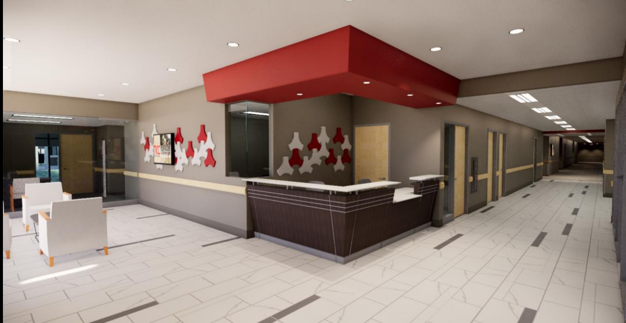
RECEPTION | LOBBY