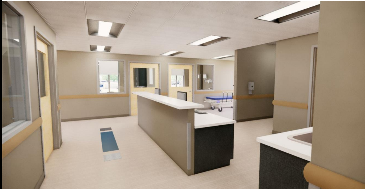
ICU NURSING STATION (SIMULATION)