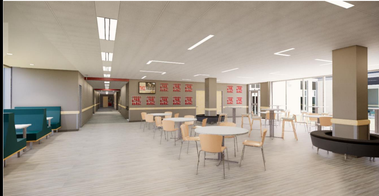
STUDENT LOUNGE | STUDY AREA