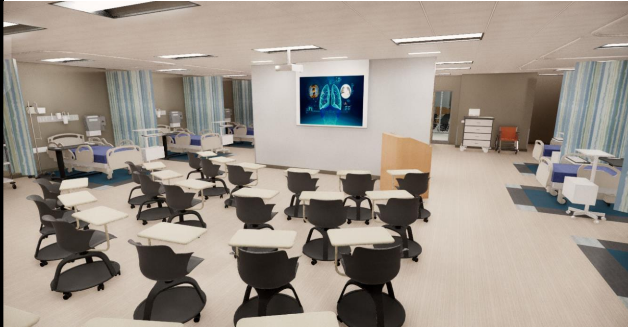
SKILLS LAB (1 OF 3)